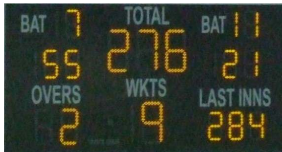
Image of score board similar the one on order