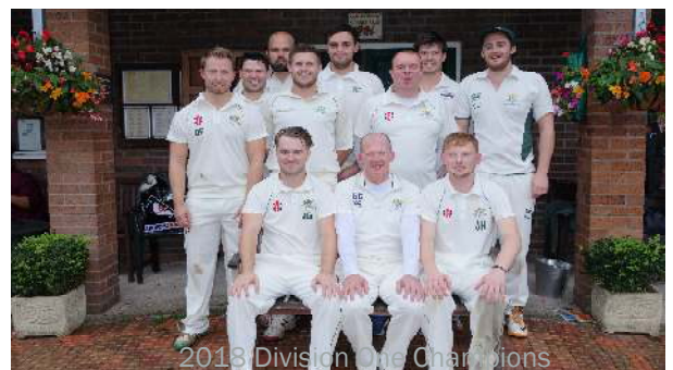
2018 Division One Champions Junior Competition - Name the players in this picture—see page 2

Our first team return to the North Wales Premier Division as the 2018 Division One Champions. The team that played the final game of the season (picture opposite) contained 8 players that had all played as junior players at Pontblyddyn which is proof of how important our junior players are – they are our future.